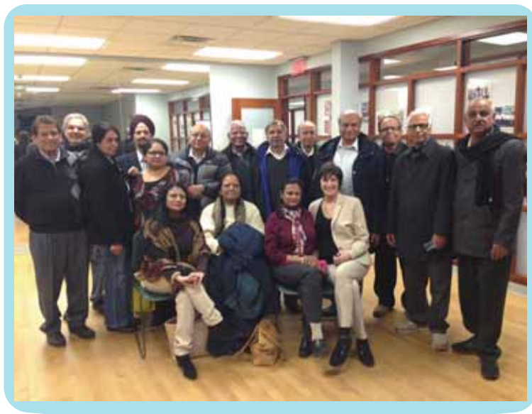
Oyster Bay Enrichment Center